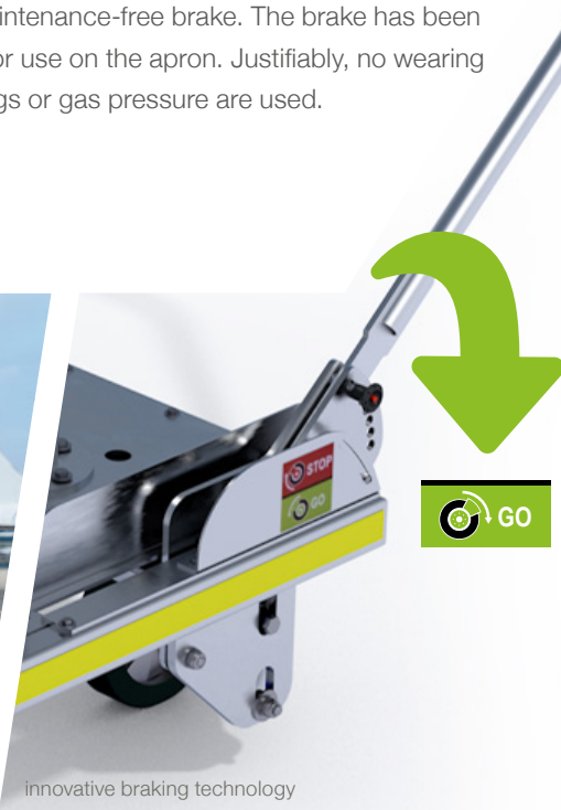
innovative braking technology

A decisive advantage of the travi ML apron trolley is the purely mechanical and maintenance-free brake. The brake has been tested specifically for use on the apron. Justifiably, no wearing parts such as springs or gas pressure are used.