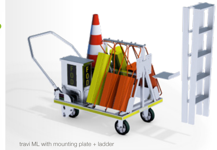
travi ML with mounting plate + ladder

In addition, the apron trolleys can be individually extended, depending on requirements. A stable, specially developed mounting plate makes it easy to add component parts such as blocking systems or additional loads such as ladders.