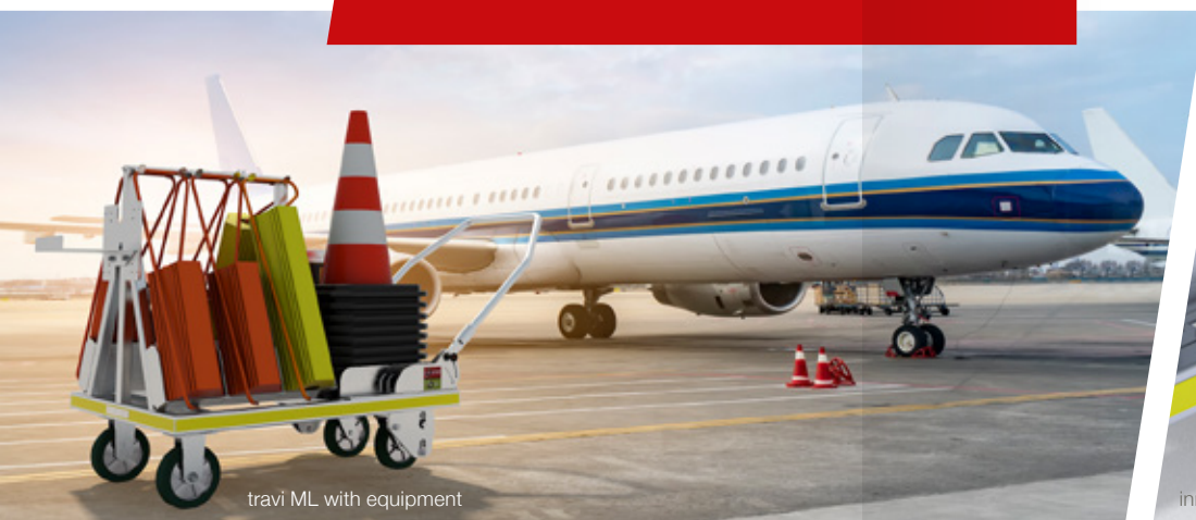
travi ML with equipment

Developed together with German airports, successfully tested by public organizations and approved for the apron. The TRAVIATION apron trolleys ensure more safety on the apron, support work safety and improve the efficiency of apron handling.